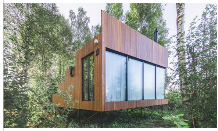
Thermory Benchmark thermo-ash cladding few months after installation. Maidla Nature Resort in Estonia