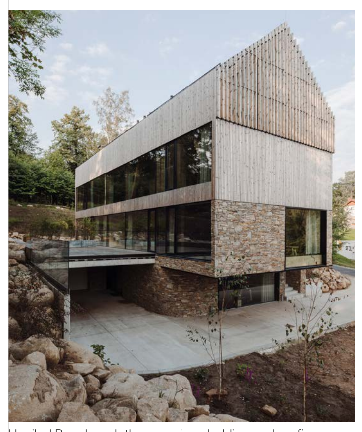
Unoiled Benchmark thermo-pine cladding and roofing one year after installation. Apartments in Poland Photo and distribution: Komplex Market