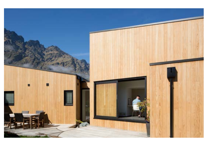
Benchmark thermo-radiata pine cladding. Jack's Point House in New Zealand