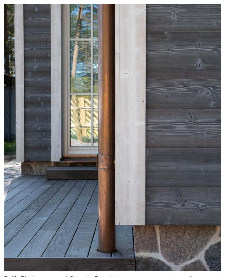
Drift Platinum and Sandy Pearl thermo-spruce cladding. Private house in Estonia.

Coated cladding exposed to UV light after 3 years, the southern side of the house in Estonia