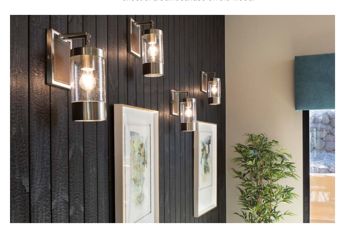
Ignite 5 thermo-spruce cladding. New American Home in USA

Reapplying the black paint regularly preserves the visual effect of a burnt surface on the wood.