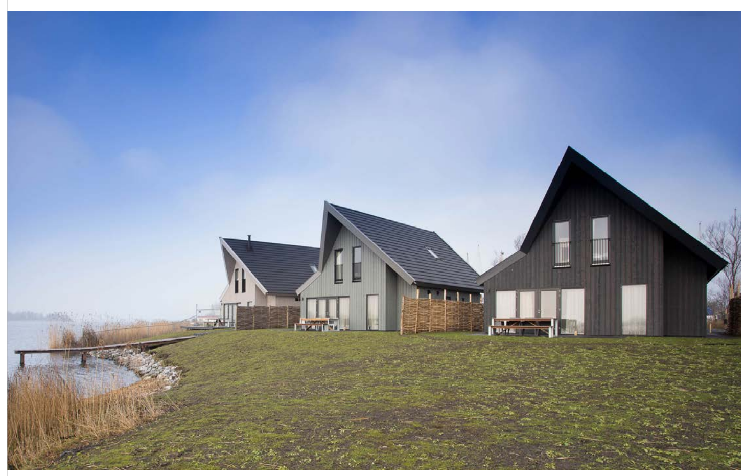
Vivid Opaque thermo-spruce cladding. Holiday Houses in Netherlands Distrubution & Photography InterFaca