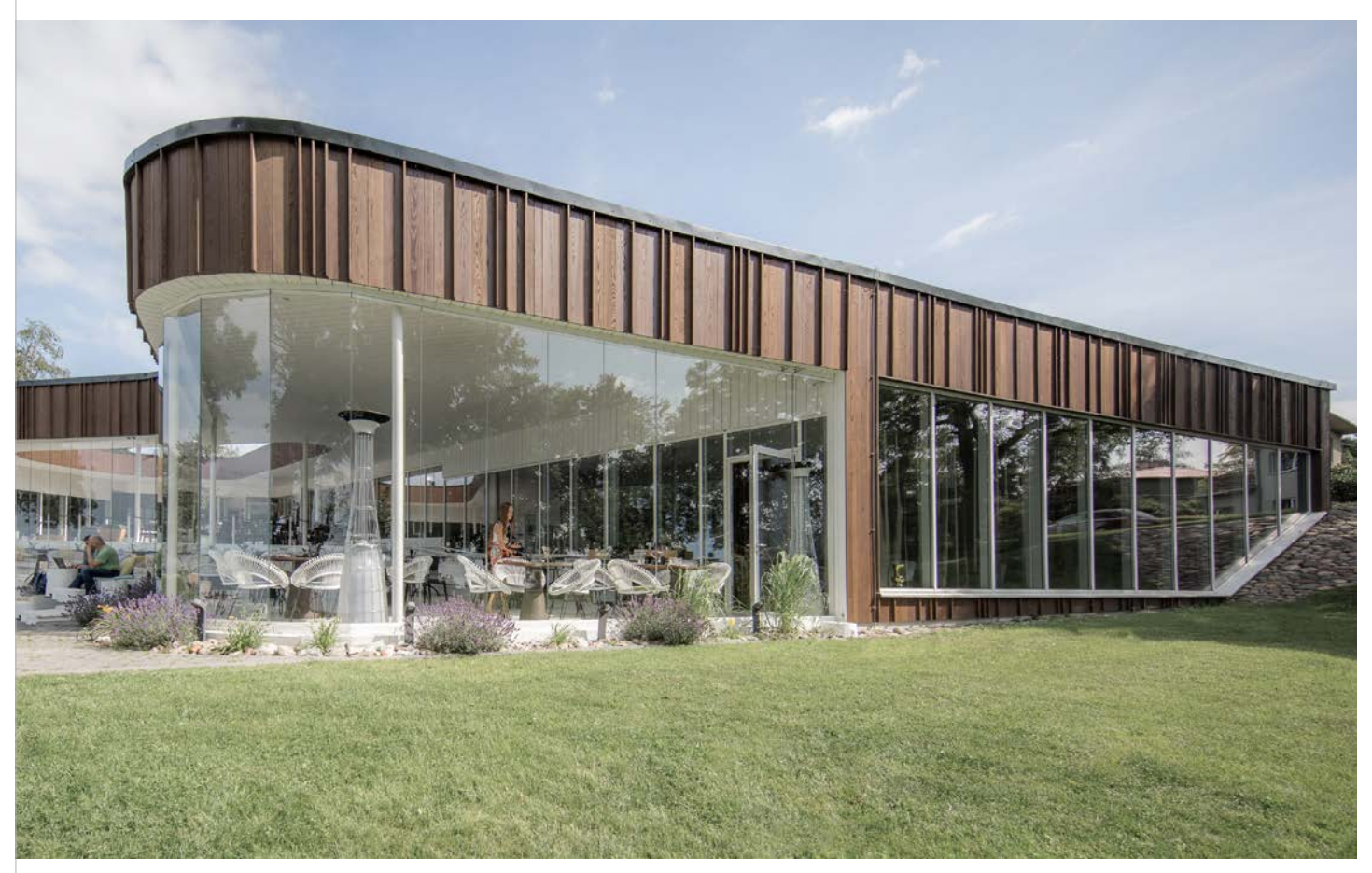
Oiled Thermory Benchmark thermo-ash cladding. NOA Restaurant in Estonia