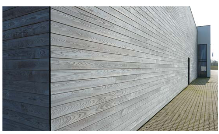
Unoiled Thermory Benchmark thermo-ash one year after installation Denmark