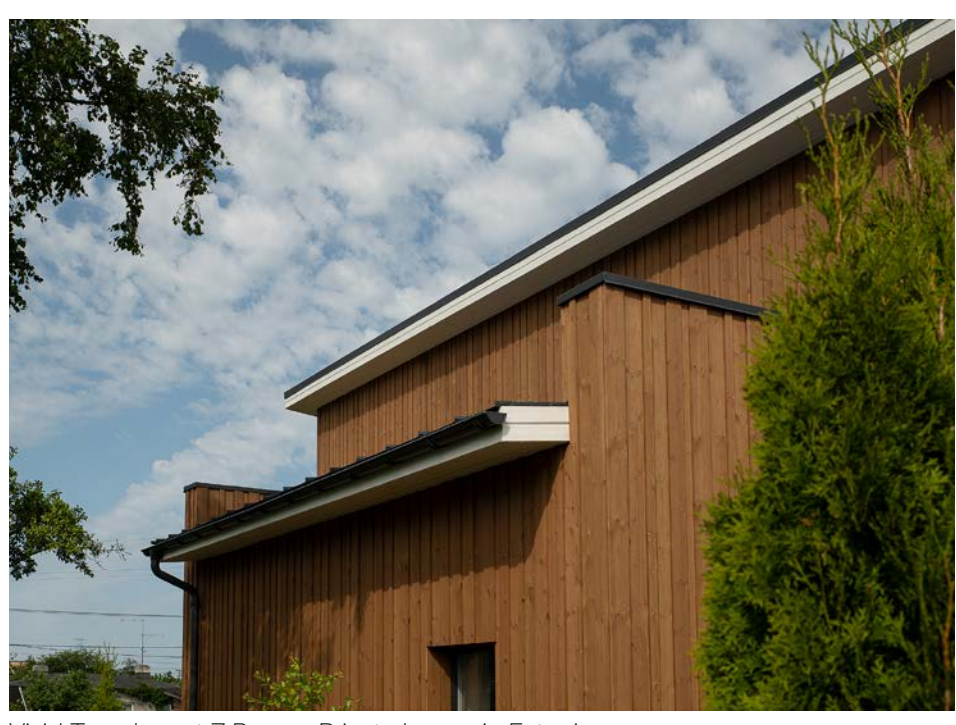
Vivid Translucent 7 Brown. Private house in Estonia

To finish, choose a semi-translucent (semi-opaque) water-based paint based on the tone you want to achieve for your façade.